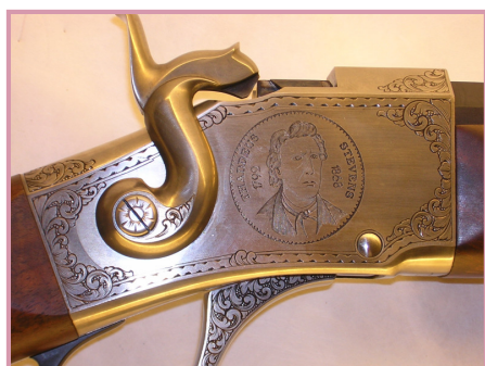
Detail of rifle on display in archives.

If you haven't been to the LRC since the beginning of fall semester, then take a look at some of the things you've missed!