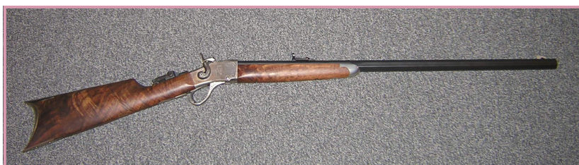
The commemorative rifle on display in the archives is pictured above.

The rifles were manufactured by C. Sharps Arms Co. located in Big Timber, Montana and owned by Stevens alumnus, John Schoffstall ('61-Mechanical Engineering). In a flyer distributed to promote the raffle, the gun is described as a "New Model 1875 Sharps Custom Grade, caliber .45-70, featuring presentation fancy walnut, classic steel crescent buttplate, German silver nose cap, engraved receiver with a French gray finish, 30" octagon barrel with blade front and buckhorn rear barrel sights as well as a New Ideal Tang Sight." The engraving on the right side is a portrait of Stevens and on the left side are the words, "Champion of Free Schools Friend of the Poor and the Downtrodden."