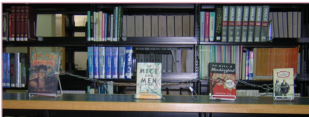
Chained books were part of the Banned Books Week display.