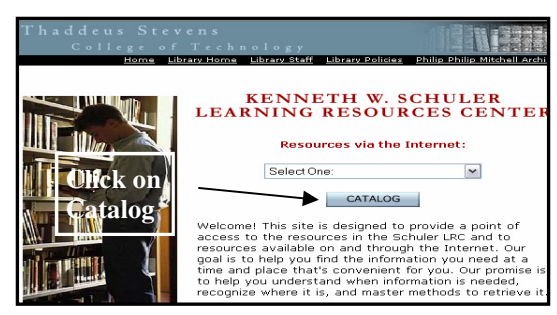
Fig. 1 - - Library Web Site

Take a moment to try out this added feature to the online catalog; it's a quick and easy way to see what new materials have been added to your library.