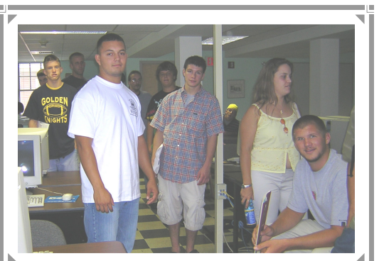
An orientation group tours the English Lab.