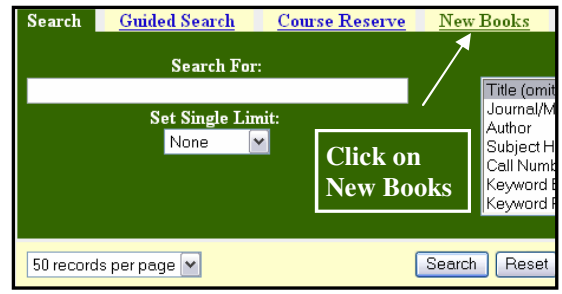
Fig. 2 - - Basic Search Screen of Library Catalog