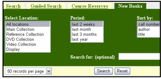
Fig. 3 - - Search Options for New Books